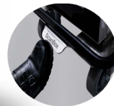
includes central brake